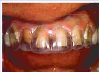
Figure 20 —Using a polypropylene matrix to gauge gross reduction.