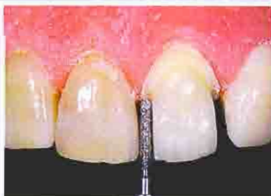
Figure 7 —Initial margin placement is done right to the level of the gingiva facially and interproximally. Interproximally, a KS1 is used so as not to damage adjacent teeth.