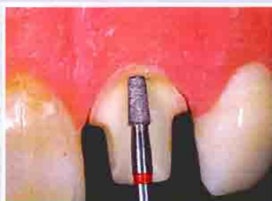
Figure 17 —Final margin finishing is completed with either the #8845KR-018 or #8845KR-025 fine diamond.