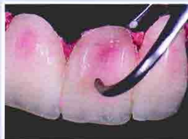
Figure 23B —The prototype is measured for optimal thickness, and appropriate adjustments are made to the preparation to obtain the ideal reduction.