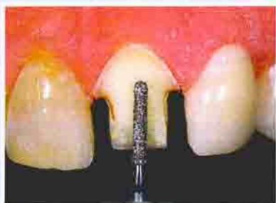
Figure 10 —Axial reduction is completed using the same KS diamond used for the depth cuts.