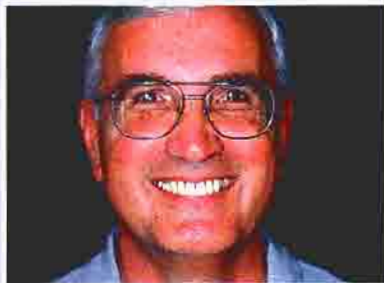
Figure 25C —Full-face view of the same case. This is an excellent esthetic result for a patient in his late 60s.

the proper materials and design criteria are followed. Captex™ restorations require 1.2 mm of facial reduction for a predictable esthetic outcome, which is less than what is generally required for conventional metal-ceramics. Proper preparation techniques are of primary importance for esthetic success with metal-ceramic restorations.