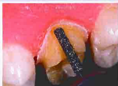
Figure 14 —Lingual reduction for posterior teeth is done with a KS2 or KS3 diamond.

restoration should be to allow for 1.2 mm of space labially. Incisal or occlusal reduction is initiated with a KS3 diamond. Incisal edge reduction of 2 mm is adequate for good esthetics. The diameter of the KS3 is 1.6 mm, so going slightly deeper gives the necessary 2-mm reduction (Figure 11). The adjacent incisal edge can also be gauged as