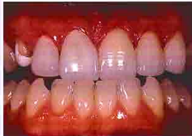
Figure 2 —Preoperative condition where the structural integrity of the remaining tooth was ideal for bonded porcelain.