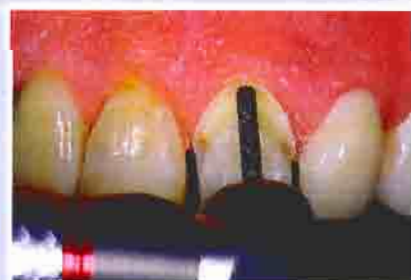
Figure 6B —Facial view of margin placement done with either the KS1 or KS2 diamond.