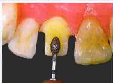
Figure 13 —Lingual reduction is accomplished on anterior teeth with the egg-shaped KS4-024 diamond.