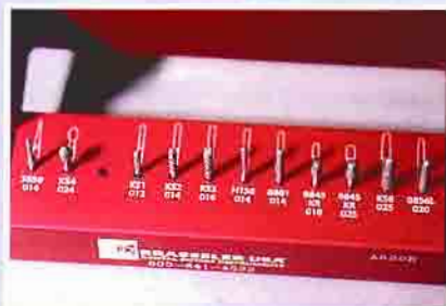
Figure 4 —The UCLA Center for Esthetic Dentistry Metal-Ceramic and All-Ceramic Preparation Kit by Dr. McLaren.

can be controlled by a number of techniques. Classically, it is recommended to use depth cuts to gauge the amount of reduction. This technique works only if the amount of tooth structure removal is the same as the amount of tooth structure that will be replaced. It does not work if the labial position of the tooth is being altered in the final restoration. Depth grooves generally allow the correct reduction in single-crown situations where the final restoration will follow the contour of adjacent teeth. Depth grooves are placed with a KS1, KS2, or KS3 ° diamond (Figure 9) depending on the necessary reduction. The same diamond used for the depth cuts is used to remove the remaining tooth structure to the desired depth (Figure 10). The goal for a Captek ™