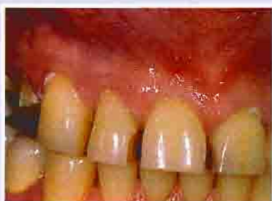
Figure 21 —A clinical case in which all maxillary teeth are to receive all-ceramic crowns. In these situations where adjacent teeth are prepared, the contact is broken using either the KS1 or KS2 diamond.