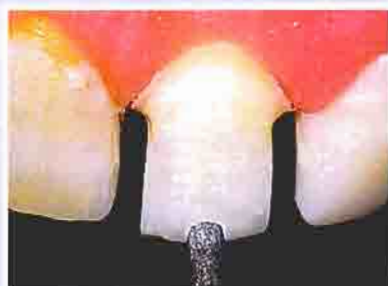
Figure 11 —Incisal edge reduction using the KS3 diamond.