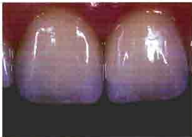
Figure 1 —Porcelain-fused-to-gold crowns on teeth Nos. 8 and 9 fabricated with a Captek™ substrate and Vita® Omega 900, a new-generation, lower-fusing porcelain.