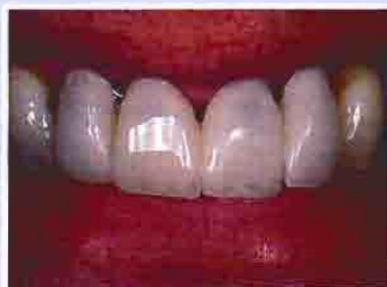
Figure 22B —A shell prototype is tried over the rough prepared teeth to assess esthetic and functional acceptance of the desired anatomical changes.