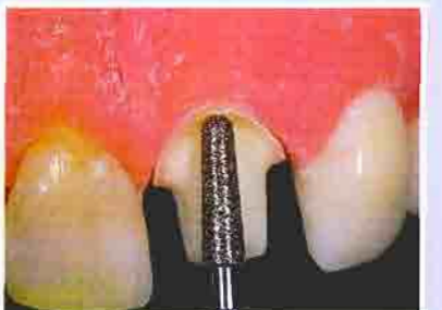
Figure 16 —The apical position of the margin is placed with either a KS1, KS2, or, as shown, a KS6 diamond.

d Ultradent Products, Inc, South Jordan, UT 84095; 800-552-5512