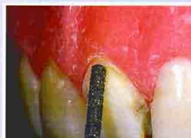
Figure 6A —Profile view of initial margin placement done with either the KS1 or KS2 diamond.