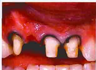
Figure 15 —A clinical case with Ultrapack ® #000 cord placed to obtain initial gingival retraction so that the margins can be finished. The margin was prepared to the level of the retraction cord.

Before finishing the preparation, one layer of Ultrapack ® #000 ® is placed in the sulcus (Figure 15). This generally gives 0.5 mm of gingival displacement. The margin is apically positioned 0.5 mm with either a KS1 or KS2 (Figure 16) diamond or, in cases with excessively scalloped gingival margins, the KS6 ® . The depth to which the margin should be placed in the sulcus is a complex issue and affect-