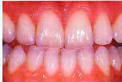
Figure 3 —Postoperative view of bonded porcelain veneers on teeth Nos. 8 and 9. Note the esthetic integration of these very conservative, bonded porcelain restorations.

Full-coverage crowns supported by a high-strength core should be considered in the following clinical situations: to replace an existing PFM restoration; when there is a compromised substrate (tooth); and when there is need for support for the porcelain. It is important to understand that porcelain gets its strength from being bonded to a high-strength substrate—either enamel, metal, or ceramic core. If the substrate has only dentin or composite—both of which are low modulus (flexible) materials—then the less flexible and more brittle ceramic will absorb a disproportionate amount of stress under load, which increases the chance for brittle failure. 7 In a study that looked at the failure load of bonded, pressed ceramics to materials of different elastic moduli, it was concluded that the failure load was proportional to the flexibility of the substrate. 8 The more flexible the substrate, the lower the failure load. Thus, thin teeth or extremely broken-down teeth, especially those with a large (and flexible) composite buildup, should not be considered for bonded porcelain restorations that have no core support. In these clinical situations, a crown should be placed that uses a high-strength core.