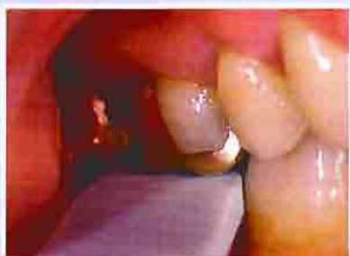
Figure 12 —Using the 2-mm Reduction Guide to check the occlusal reduction on tooth No. 30.