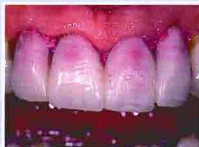
Figure 23A —The shell prototype is altered as necessary for esthetics and function. The prototype is then relined with a fast-set PVS bite registration material.