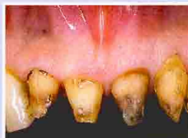
Figure 22A —Rough preparations immediately after old restoration removal.

ed by many variables. 6,10 The ultimate goal of margin placement is to have an esthetic restoration/gingival interface without biologic complications (ie, violation of biologic width). The marginal area is then finished with either the #8845KR-018° or #8845KR-025° finishing diamonds, or the H158-014° carbide finishing bur (Figures 17 and 18). Axial contours are finished with the #8881-014° or #8856L-020° fine diamonds (Figure 19). For all-ceramic crowns, it is critical to round all internal line angles with one of the fine diamonds. This minimizes stress concentrations in the ceramic crown by eliminating sharp angles.