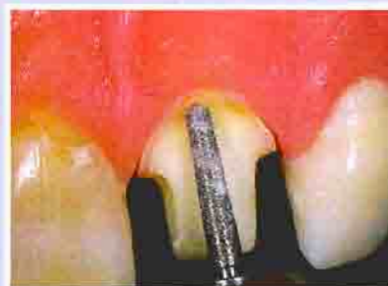
Figure 19 —Axial contours are finished with either the #8881-014 or #8856L-020 fine diamond.