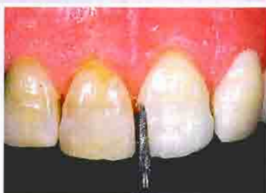
Figure 5 —Breaking contact with the #5858-014 diamond on a demonstration model in which natural teeth are mounted.