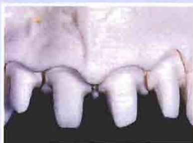
Figures 24A and 24B —Two views of the final preparations on the master casts, demonstrating ideal reduction for Captek™ restorations.