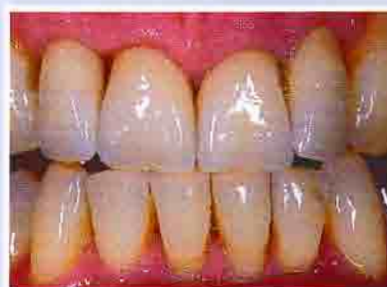
Figure 25A —View of the seated, final Captek™ crowns.

polyvinyl siloxane (PVS) impression materials. Therefore, an alternative technique will be discussed to control axial reduction.