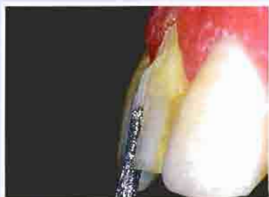
Figure 9 —Depth grooves are placed with either a KS1 or KS2 diamond.