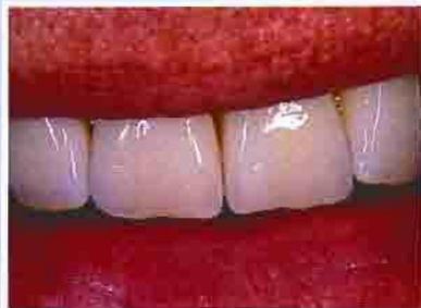
Figure 25B —View of the final Captex™ crowns. Note the esthetic match with the adjacent natural teeth.