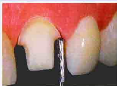
Figure 18 —The finishing carbide bur H158-014 can also be used to finish the margin.